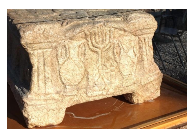
The Magdala Stone