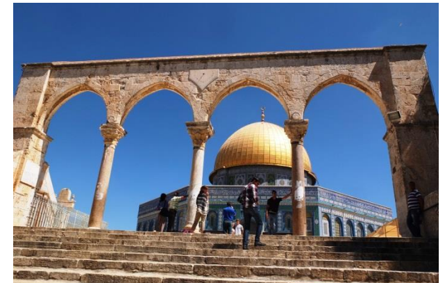
Dome of the Rock