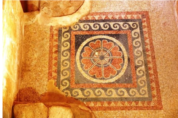
Vibrant colors mosaic